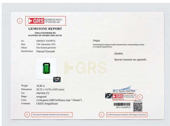
GRS report with an updated logo, disclaimer position, and address

Should you have any questions in regards to the updates made, kindly reach out to us via our contact page.