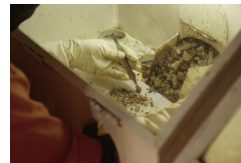
sorting the rough