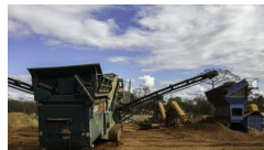
Ruby mining in Mozambique