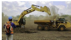
Ruby mining in Mozambique