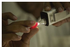
inspecting a rough ruby

Article URL: https://www.gemresearch.ch/news/2013/10/24/a-review-of-beauty-and-rarity-of-mozambique-ruby