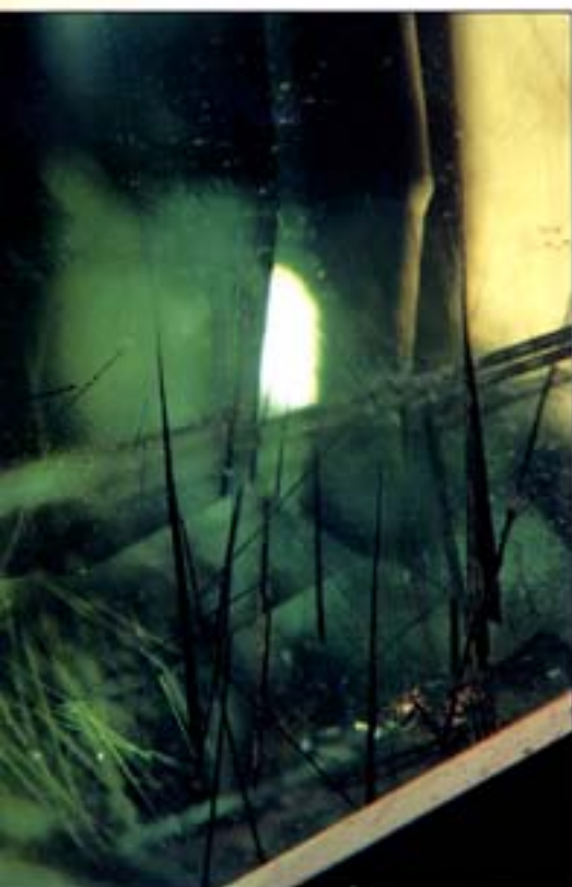
Figure 1: Microphotograph of black spiky needles occurring in a large Peridot from Suppatt, Pakistan, magnification on original slide 25x. Identification as Vonsenite-Ludwigite needed chemical and crystal structure analyses of the inclusions.

A portion of a needle-like black inclusion, which was analyzed by the Gandolfi method, is shown in Figure 2 . It was separated from an approximately 60 carat rough Pakistani Peridot. Another rough Peridot was polished at a level flush with inclusions so that they were exposed at the surface for electron microscope and chemical analyses. The data obtained of the crystal structure analyses are shown in Figure 3 . The data indicates that the black needles belong to the Vonsenite-Ludwigite series