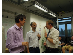
Intense discussions between three of the authors on future projects and testing protocols of Tibetan andesine.