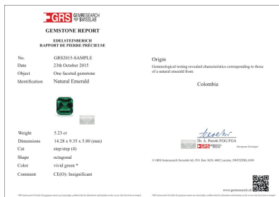
Front-page of GRS report with "Old Mine / Muzo Green" appendix.

Below is the revised version of the emerald report appendix: