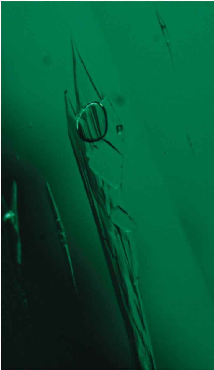
A 3-phase (liquid, solid, vapor) inclusion typically found in a Colombian emeralds.