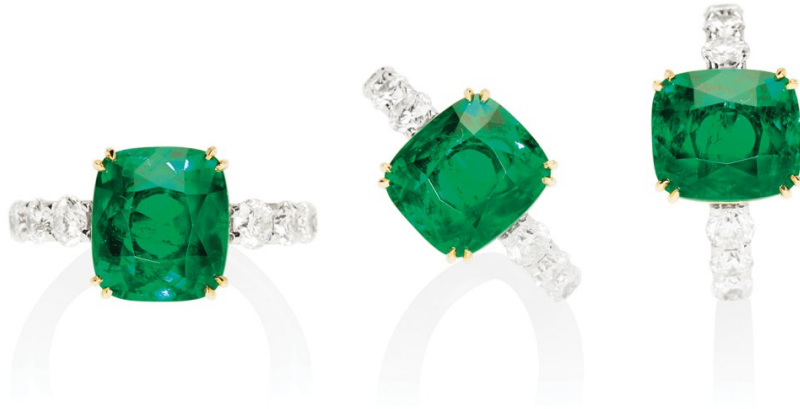
Colombian emerald ring 5.70 ct, no indication of clarity enhancement with “Old Mine / Muzo Green Appendix”. GRS Collection. GRS2016-028509.