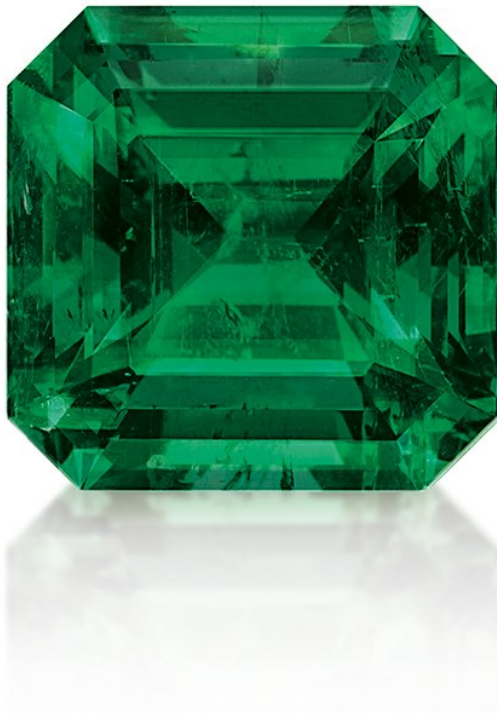
Vividly saturated Colombian emerald displaying the legendary colors found in the world renowned Muzo mines.

The main cause for color in emerald is chromium (Cr) and vanadium (V). “Old Mine / Muzo Green Appendix” emeralds are rich in their chemical concentrations and thus have a comparatively high content of Cr and V when compared to emeralds from most other localities. Colombian emeralds mostly contain distinct and typical three phase inclusions consisting of tiny crystals and a gas bubble in liquid.